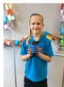
Reusable Coffee Cups

Support the Environment. Buy our reusable coffee cup - get a free drink!